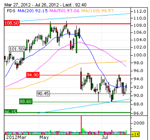
Charts @ Surperformance .com